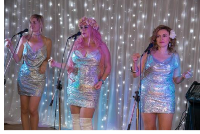
posed and recited by Chairperson The Mermaids Dance Band entertained until late